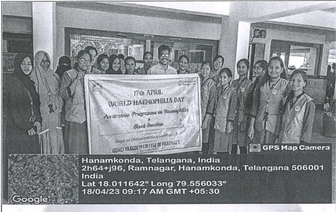
Awareness programme on Haemophilia and Blood Donation